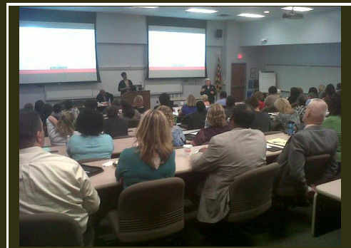
A-133 workshop in September

Following is the list of upcoming workshops, all held at the Maryland Fire and Rescue Institute in College Park, Maryland. These (no-fee) workshops are for anyone who is managing a federal (or pass-through) grant. Seating is limited, and pre-registration is required. Click on a link for more information and to register for a workshop. Please note that the October 10 DATA ACT training, originally designed as a live workshop, has been changed to a WEBINAR. (Also note that both the Data Act webinar and the Cost Principles workshop may have to be cancelled and rescheduled due to the federal government shut-down, in which case we'll email people who registered.)